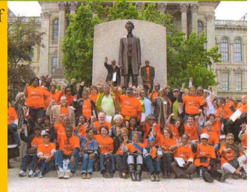
Last Year at the Lincoln Statue

DEMAND that Capitol Hill be accountable to local communities